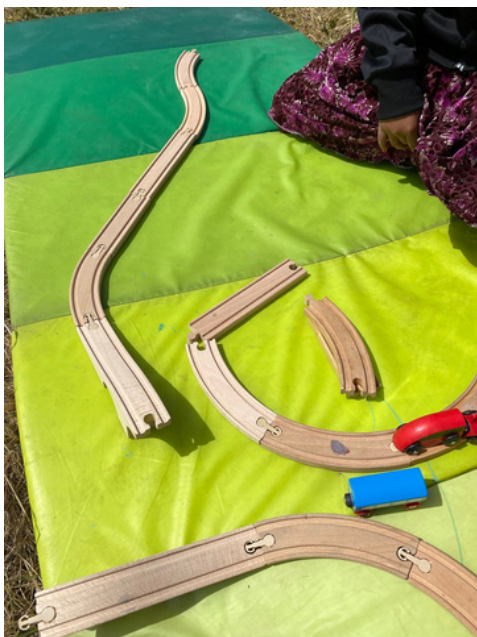
^ Train tracks

Alongside our themed activities, we offer a variety of free play options and set aside time at the end of the sessions for child-led play. This is a great moment when children can make their own choices and decide what they want to do! Highlights this month have included: