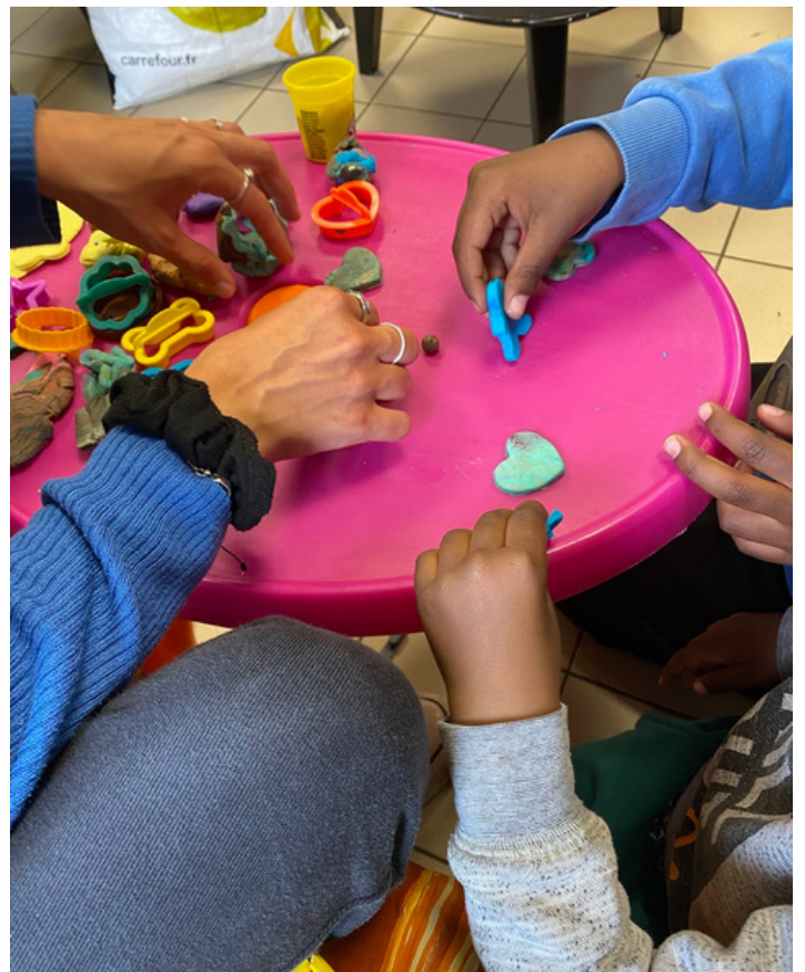
^ Play doh football!