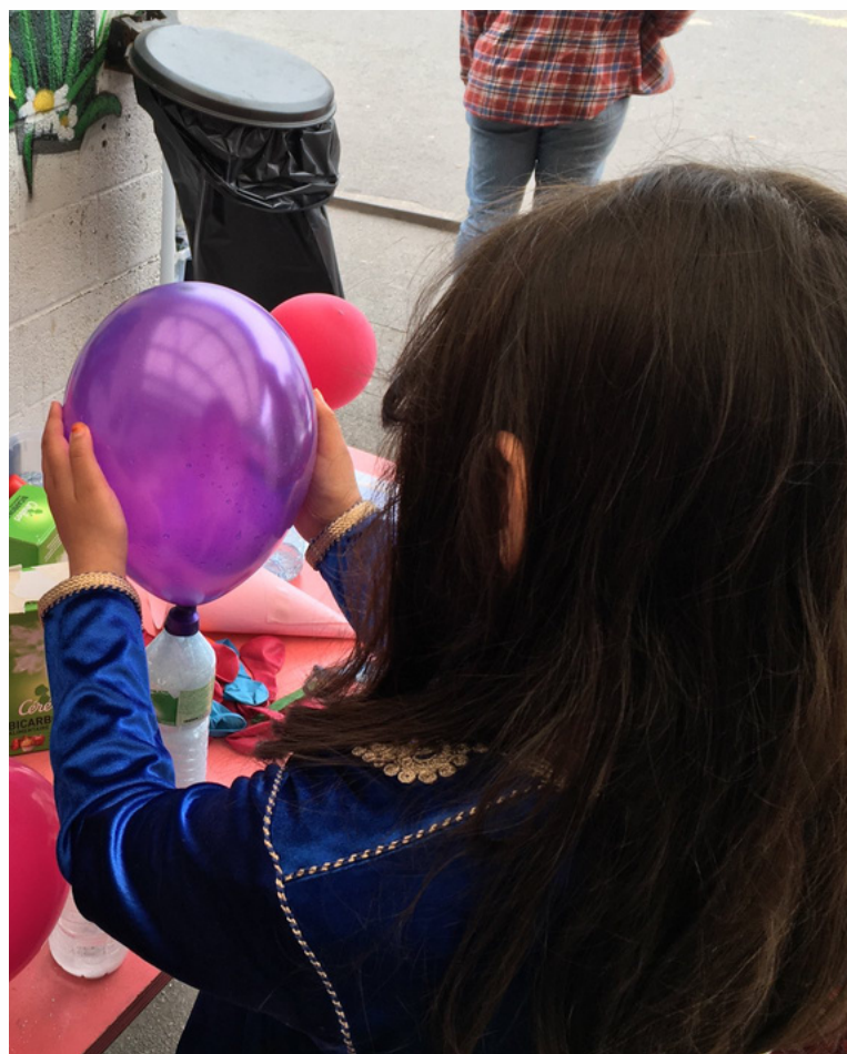
^ Balloon experiment

We ended the week by participating in the 'Journée Talents des Femmes' animated by the Secours Catholique! We animated various activities so all children could do something they enjoy. We had a station of face painting where we transformed ourselves into tigers and butterflies. We did an experiment where we filled balloons with vinegar and baking powder and then watched them and inflate. We had an obstacle course and had a ton of fun competing amongst each other. We also made masks that we decorated with drawings, stickers, feathers and pom poms. We got our creativity on and did some colouring and drawing. We also had a ball pit and had the best time throwing the balls in and out of the ball pit! Meanwhile we had a treasure hunt and hid many small toys and puzzle books for children to find!