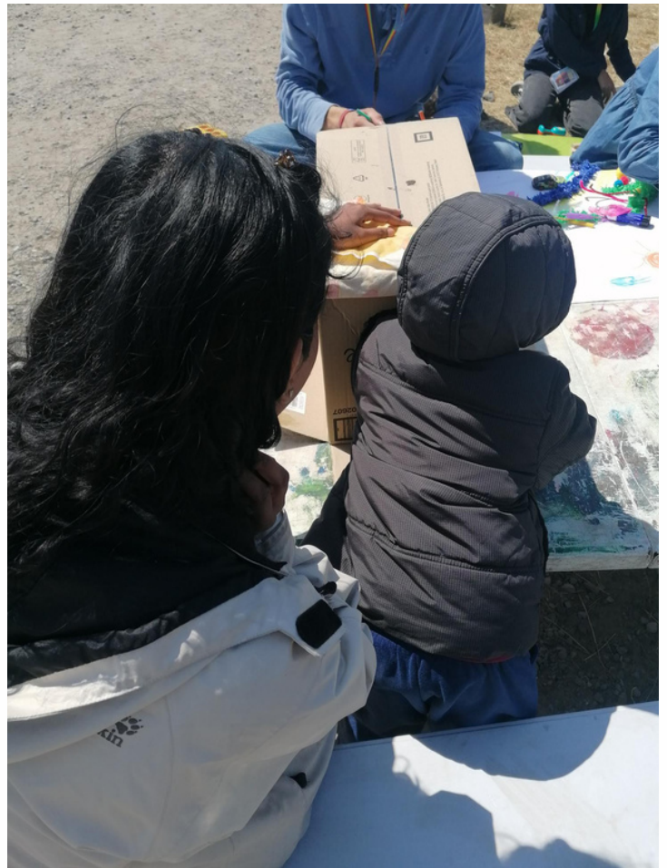
^ What's the mystery item?

We then had a big mystery box!! We put various items of different textures, sounds and shapes into this box. Then one by one, the children closed their eyes, felt and heard the item they picked, then put it back. They then guessed which item they felt! This was a fun activity as everyone was involved in saying "yes" or "no" to the guesses of each player!