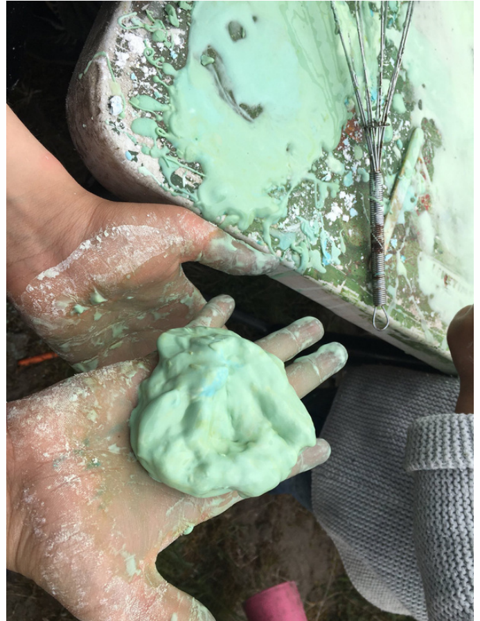
^ Now it's a solid!!

We continued the week by making sugar crystals, by mixing boiling water with sugar and food colouring to make our own personal colourful crystals.