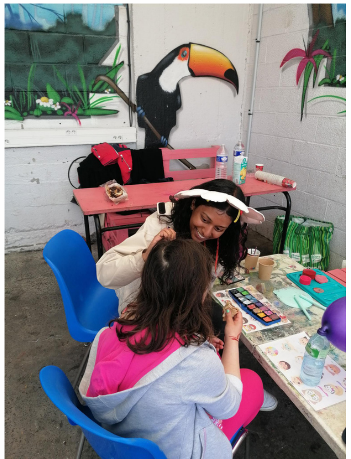
^ Our various play stations during Journée Talents des Femmes