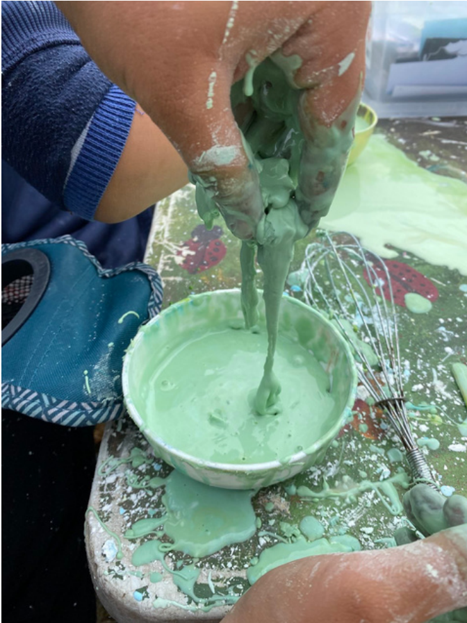
^ It's a liquid!

We started off by making oobleck, a non-Newtonian fluid that we created by mixing cornstarch and water. We then used food colouring to make our preferred colours! We had a blast watching the oobleck act like a liquid and a solid depending on how much pressure is applied to it!