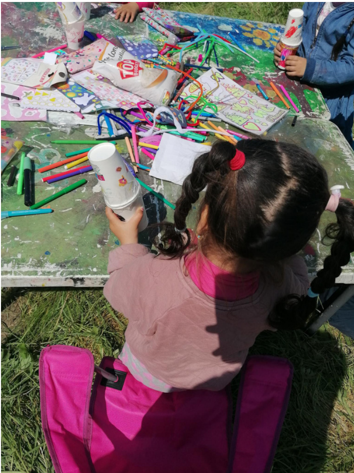
^ Shake shake!

We started off by making shakers! We filled cups with rice and decorated them with stickers, drawings, pom poms and feathers before taping them together and shake away!