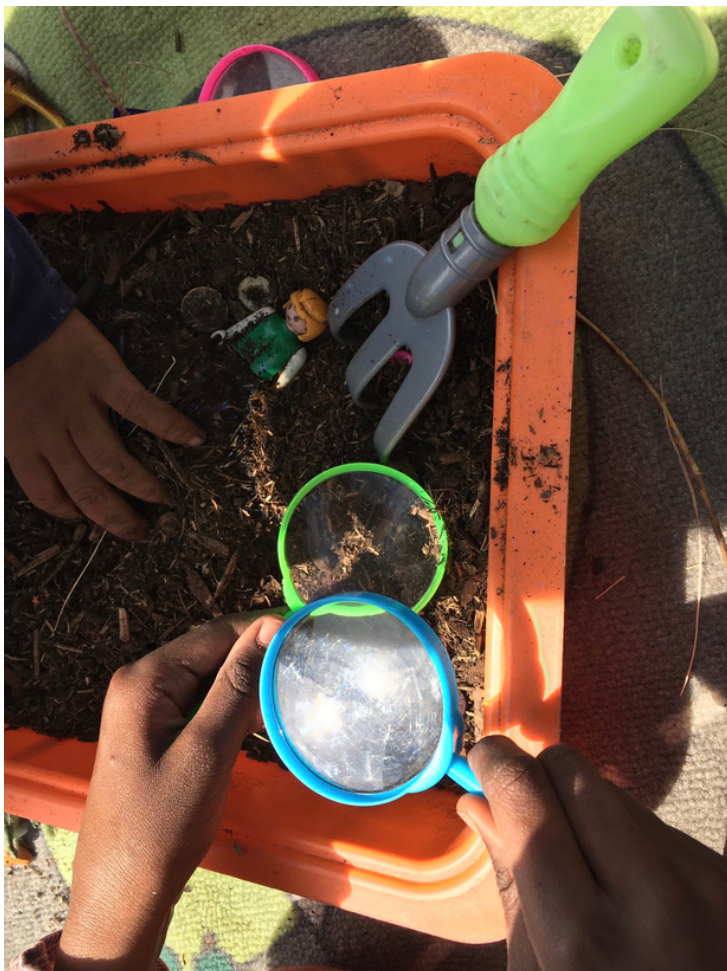
^ Exploring and finding items!