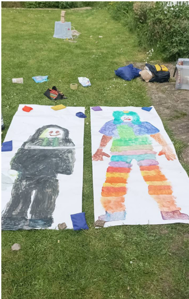
< Body tracing painting

We then had games of body balancing! We tried to balance ourselves on skipping ropes that were laid out on the floor and used little hoops to skip into!