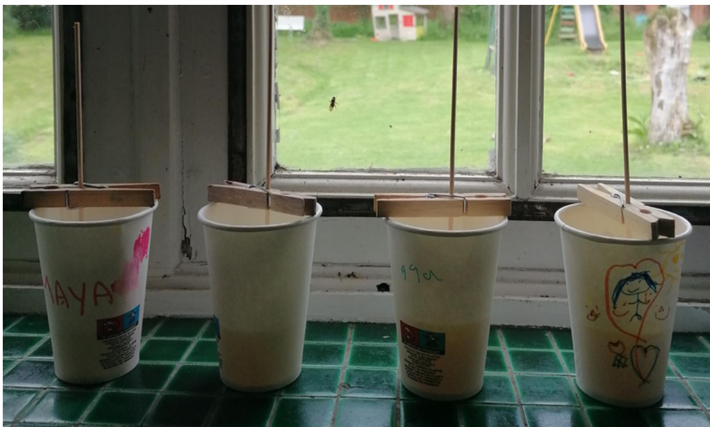
◀ Waiting for our crystals

We continued the week by making sugar crystals, by mixing boiling water with sugar and food colouring to make our own personal colourful crystals.