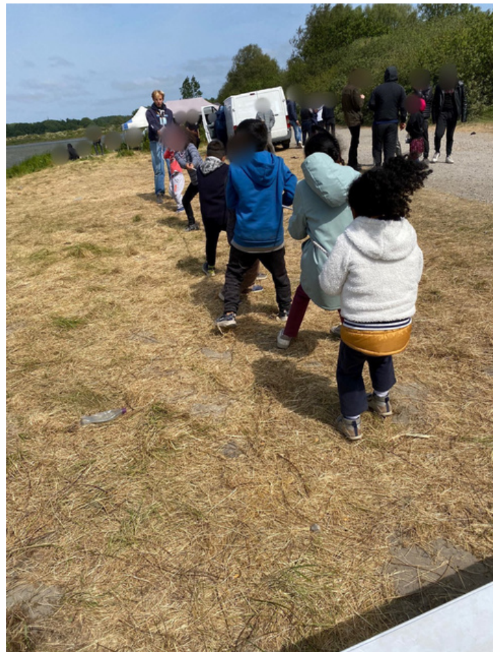
^ Tug of war!