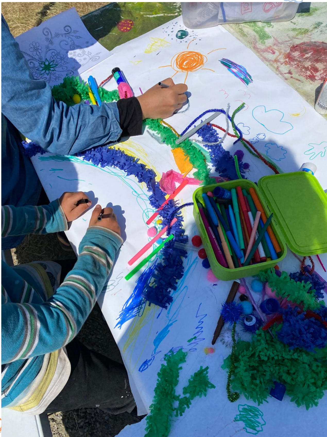
^ Our beautiful texture collage

We then had a big texture collage! We brought along various items of different textures and stuck them onto a big paper! We also drew on this paper and it became a big colourful mess!