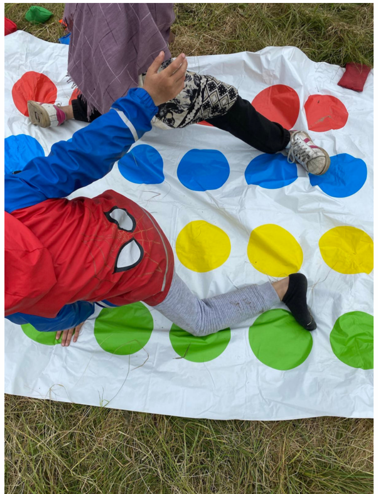
^ Twister fun!

After this, we got creative! We did some body tracing paints and tried to replicate our bodies' outlines. We then painted our figures with our favourite colours! This was a great collaborative activity where we all got involved together!